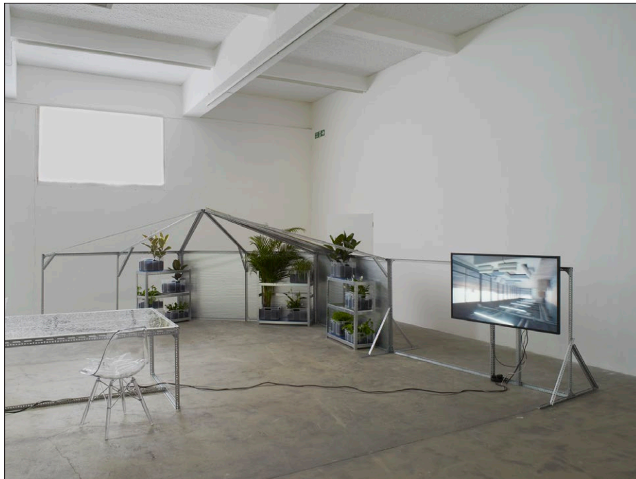
Yuri Pattison, user, space (2016). Installation view, Chisenhale Gallery, 2016.