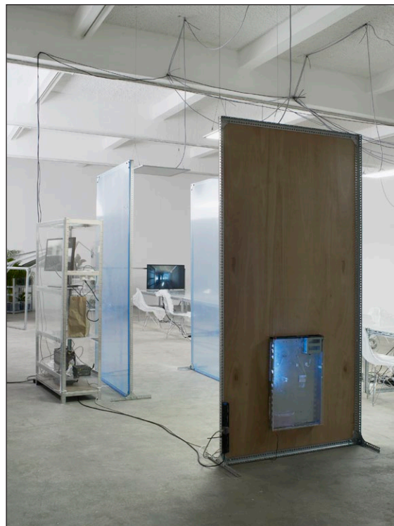
Yuri Pattison, user, space (2016). Installation view, Chisenhale Gallery, 2016.