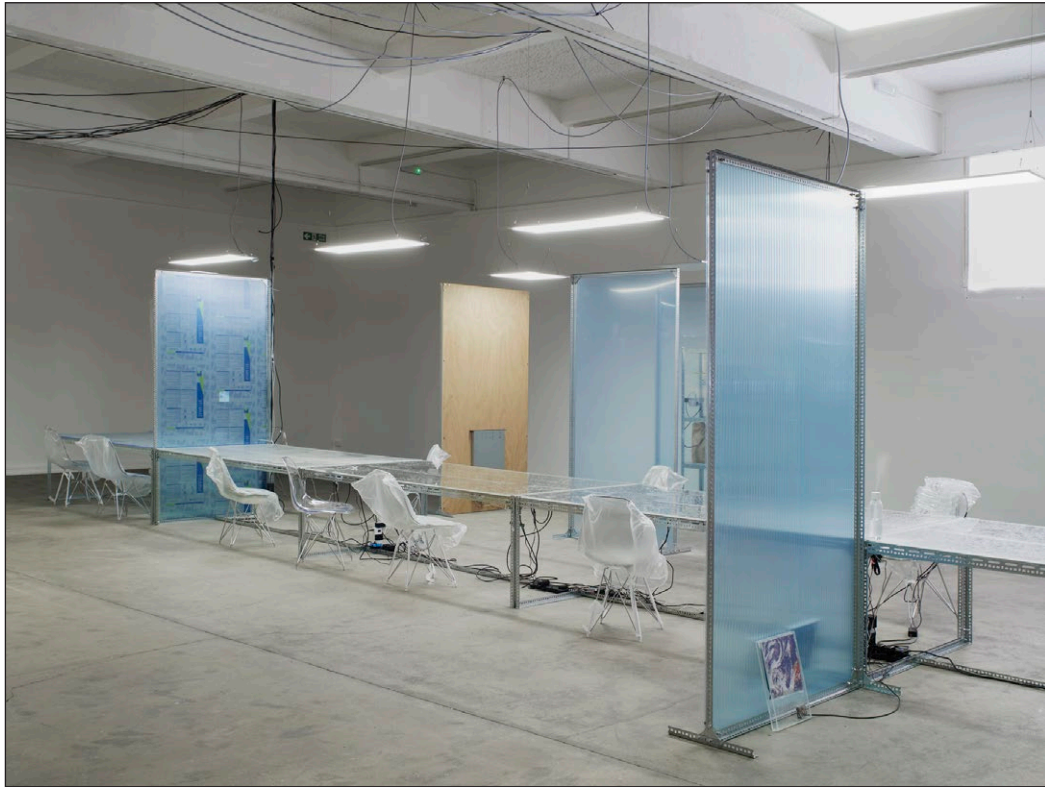
Yuri Pattison, user, space (2016). Installation view, Chisenhale Gallery, 2016.