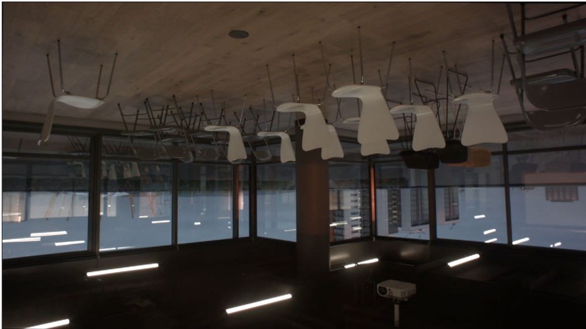
Yuri Pattison, transparent form (for user, space) . Video frame. 2016.