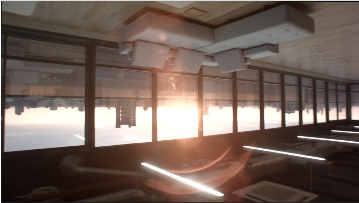
Yuri Pattison, transparent form (for user, space) . Video frame. 2016.